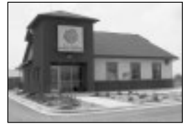
Belle Plaine Office