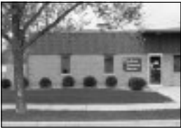
Le Sueur Office