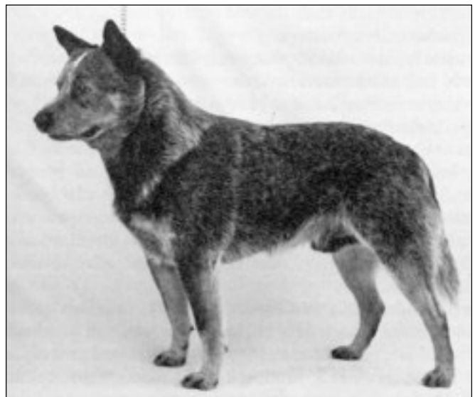
Australian Cattle Dog

Australian cattle dogs were first bred from a dingo and smooth collie crossed with a dalmation. All heeler puppies are born white and will start to get their speckled coat at about three weeks of age. They are a very protective dog and very loyal to their owners. This breed holds the record for canine longevity - 29 years.