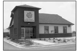
Belle Plaine Office