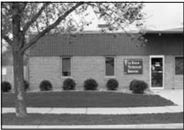
Le Sueur Office