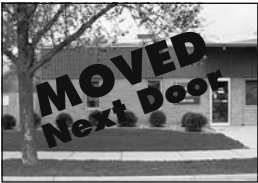
Le Sueur Office